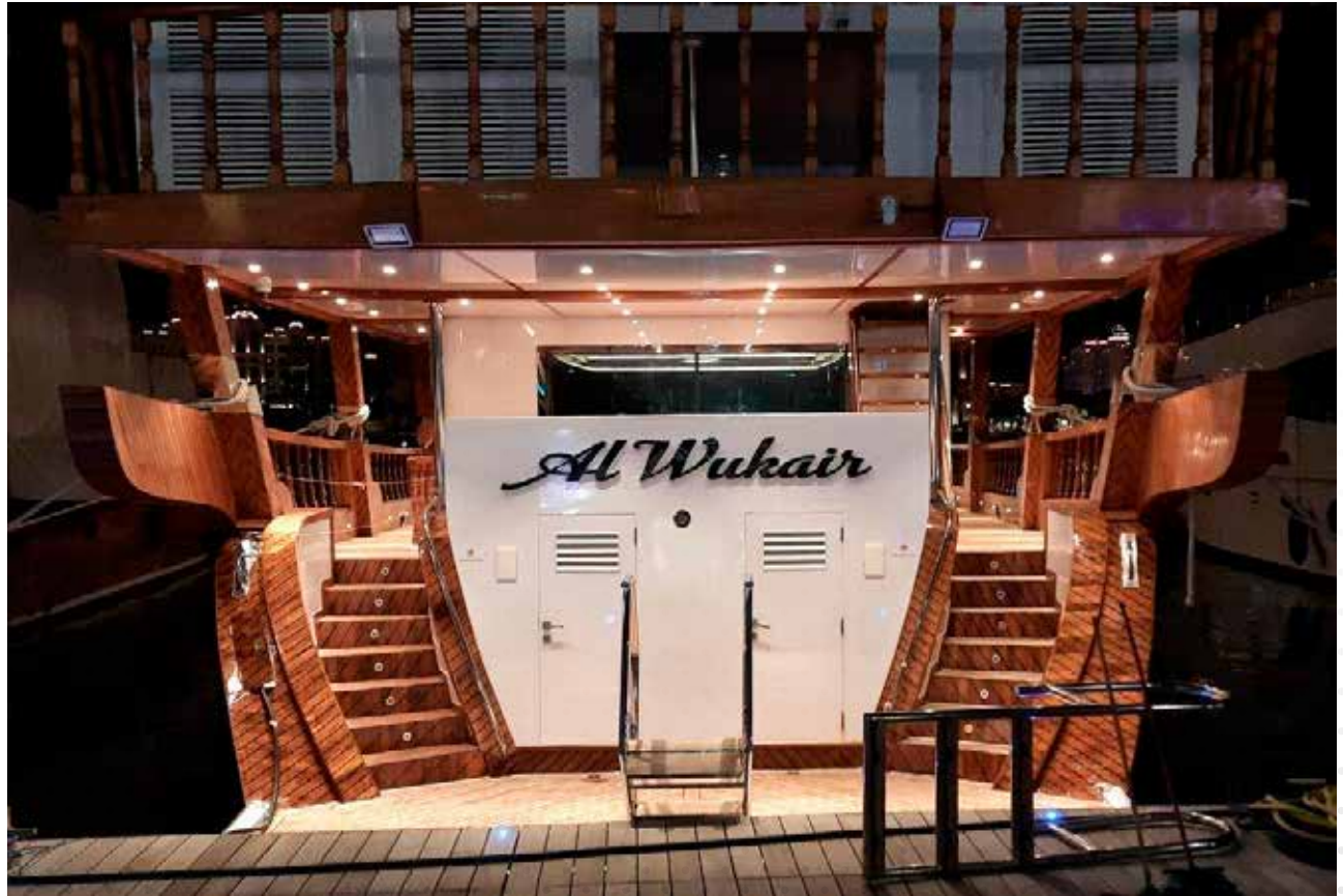
110 Feet Luxury Vessel: Maintenance & Refurbish Works