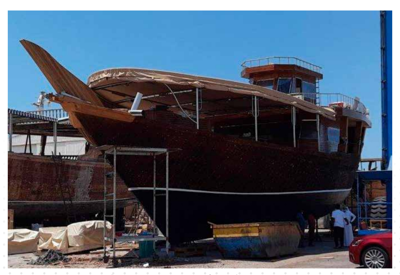
85 Feet Luxury Private Dhow: Conversion & Re-fit Works