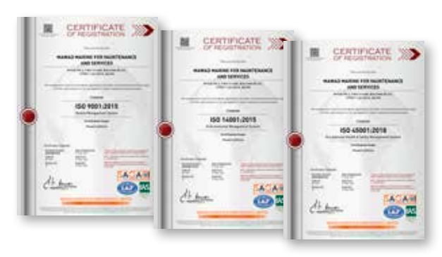
ISO Certified Company