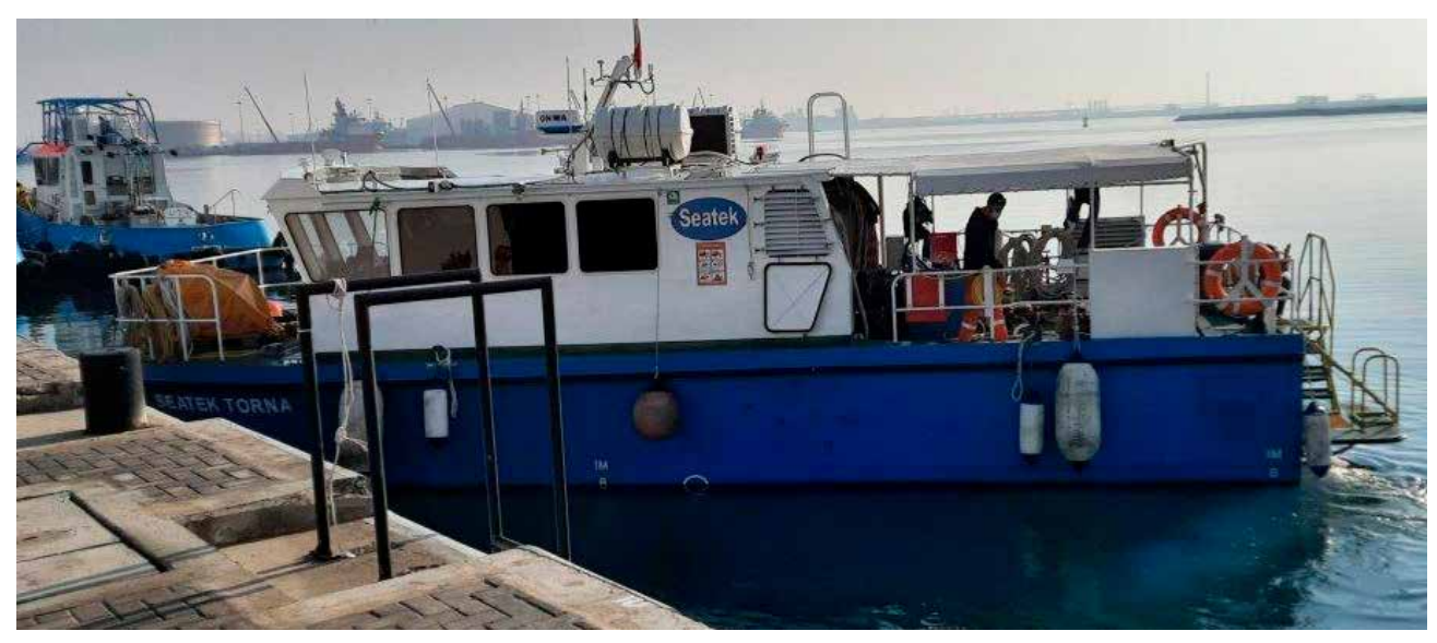
QP Diving Vessels Operated By SEATEK: Engines & Machinery Maintenance & Repairs